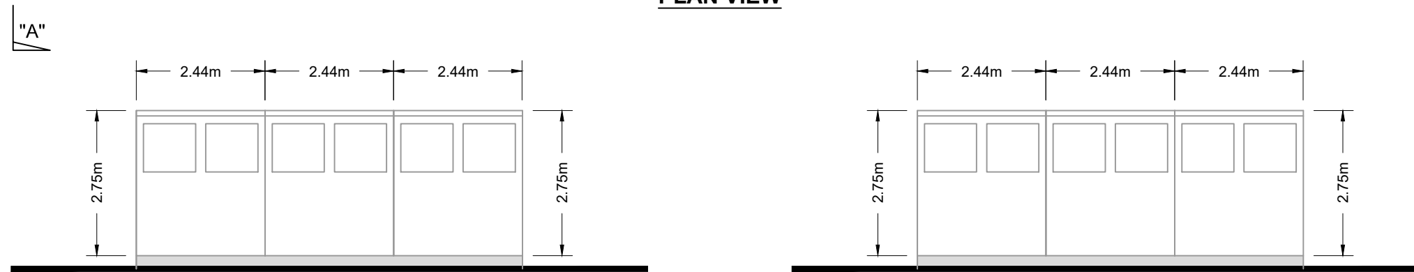
ELEVATION ON "A" - "A"